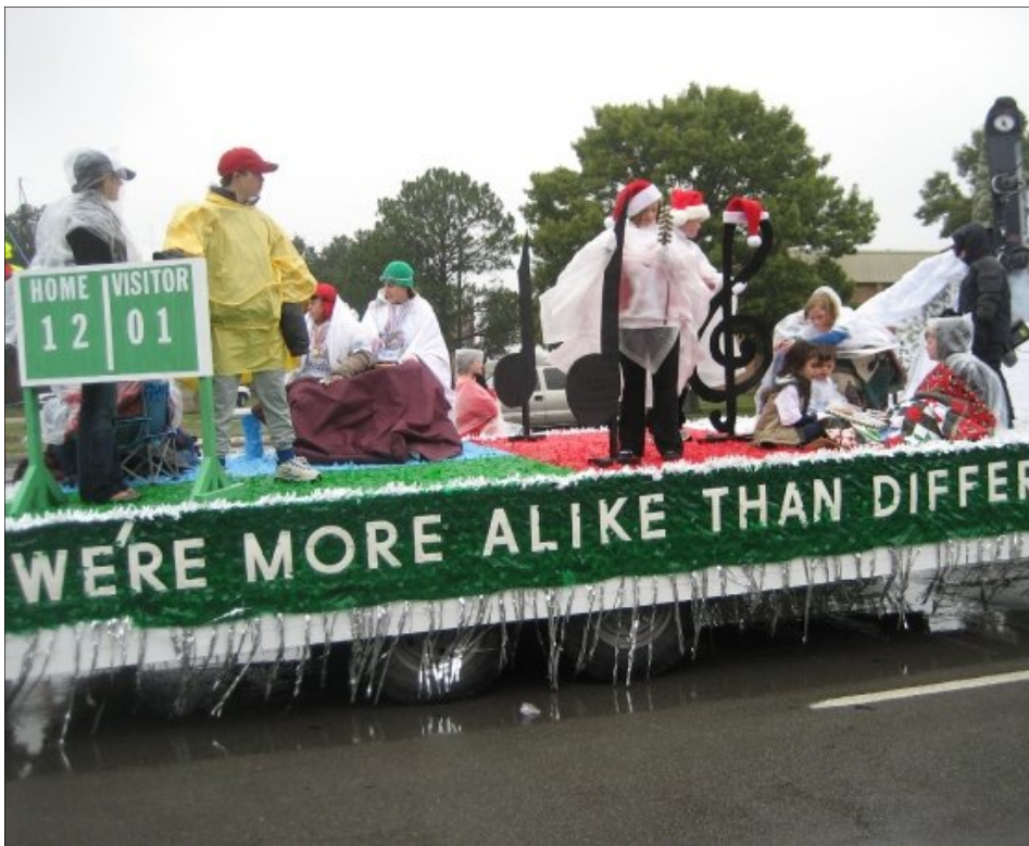
Members of the Down Syndrome Association of Brazos Valley braved the cold and rain for the 83rd annual B-CS Christmas Parade on Dec. 6, 2009.